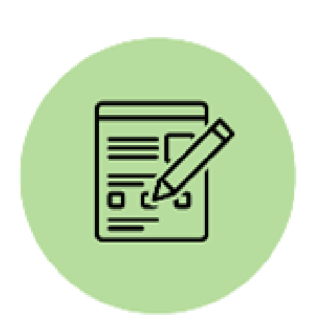
Complete Part A

Refer to page 8 of the Guidebook for Referral Agency, Authorised Officer and Training Provider definitions