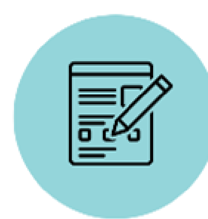
Complete Part A

Refer to page 8 of the Guidebook for Authorised Officer and Training Provider definitions